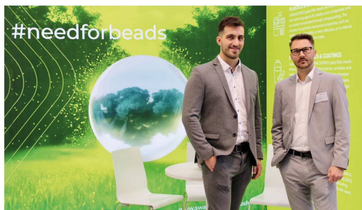
SWARCO Induserica's new booth celebrates its debut at Fakuma 2024.

At this year's Fakuma, we impressed guests with a fresh, modern trade fair booth. Our new booth design, which emphasized the industrial nature of our solutions, showed off SWARCO's technological strength and attracted a lot of attention from the trade fair audience. The focus was clearly on innovation and progress, with a future-oriented look replacing the previous marble design.