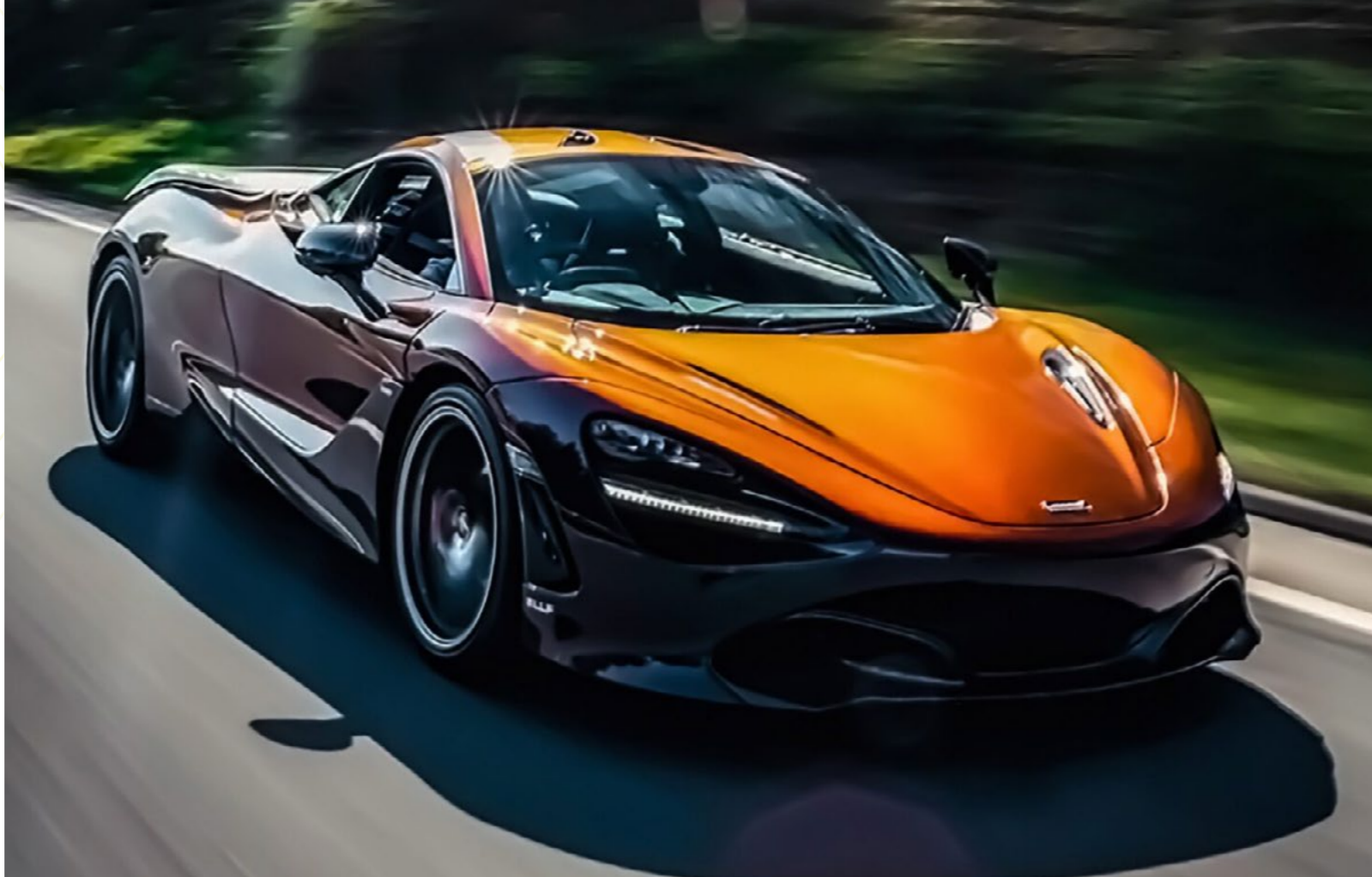
RheoLight offers luxurious, dynamic colour shades and impressive light effects that bring surfaces to life.