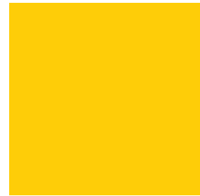
approx. RAL 1023