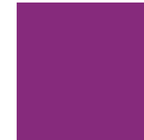
approx. RAL 4006