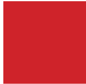
approx. RAL 3020

EUROTHERM – preformed markings, a SWARCO brand