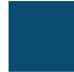
approx. RAL 5001