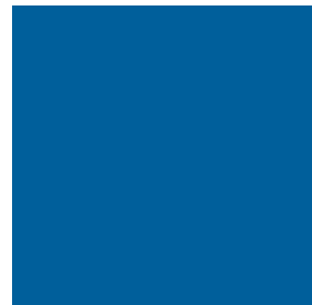
approx. RAL 5017