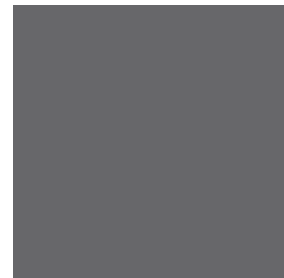
approx. RAL 7043