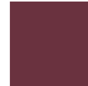
approx. RAL 3005