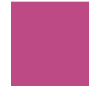
approx. RAL 4010