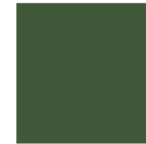
approx. RAL 6020