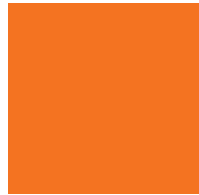
approx. RAL 2009