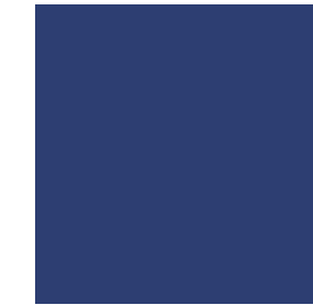
approx. RAL 5022