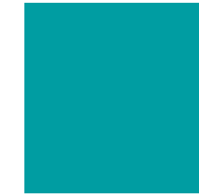
approx. RAL 5018