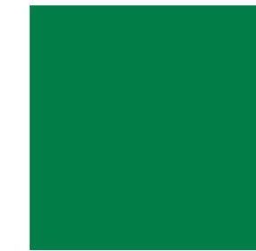
approx. RAL 6029