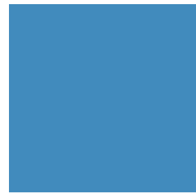
approx. RAL 5012